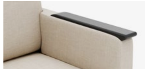
ARM CAP, POLYURETHANE