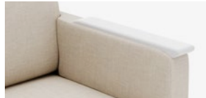
ARM CAP, SOLID SURFACE