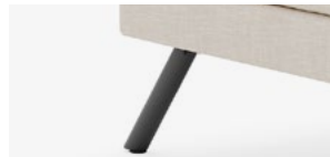
WALL SAVER LEG