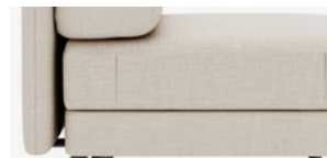
PUSH-THROUGH CLEAN OUT